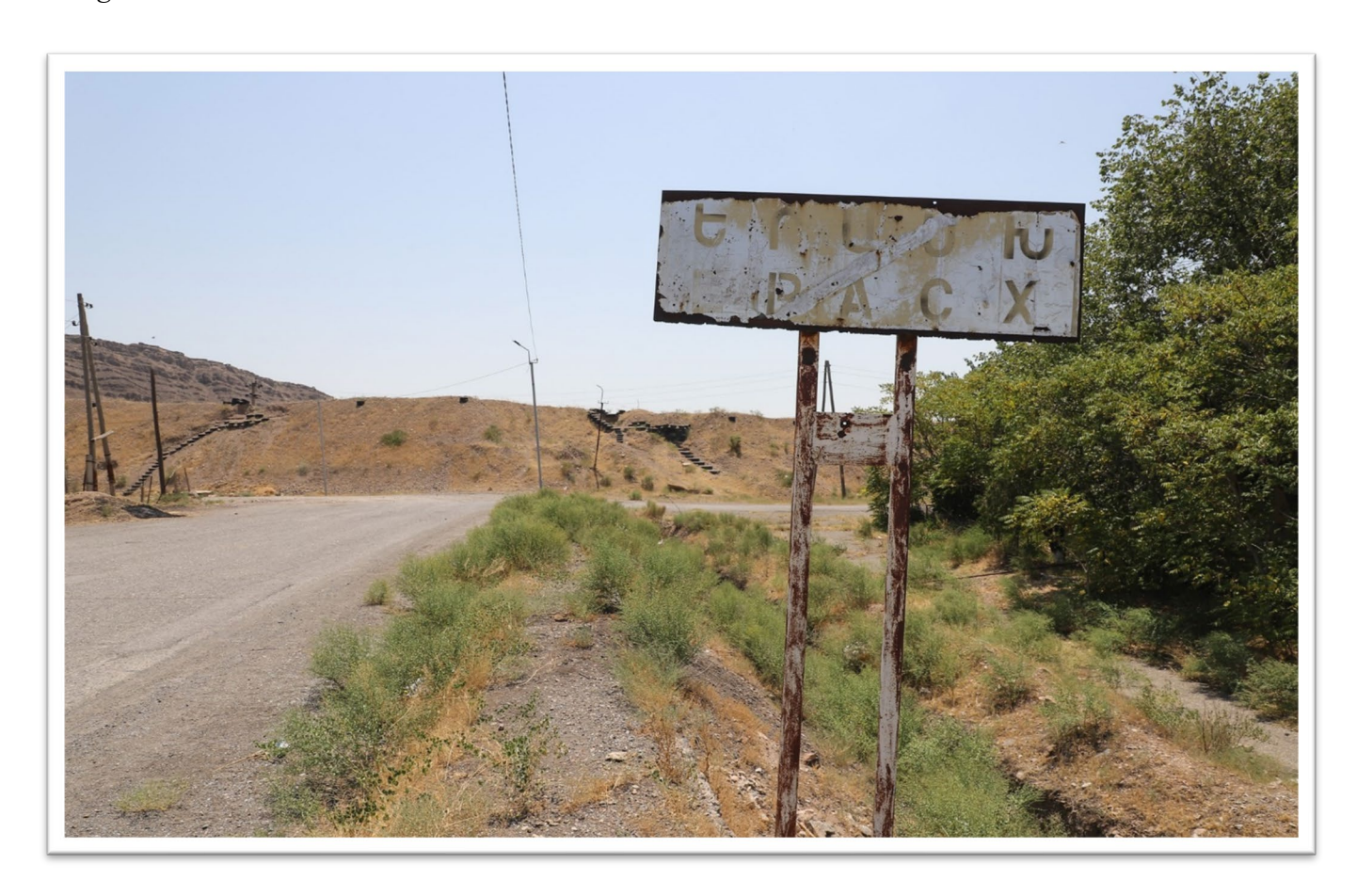
Picture 1: The Azerbaijani military positions are located at the peak of the mountain situated behind the sign.