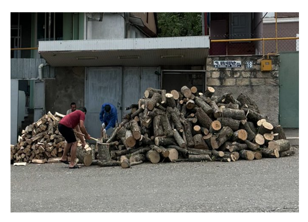
105. Therefore, as a direct result of the disruption of the supply of natural gas and electricity, 6-hour rolling blackouts have been implemented in Artsakh, further aggravating the humanitarian consequences of the blockade of the Lachin corridor.