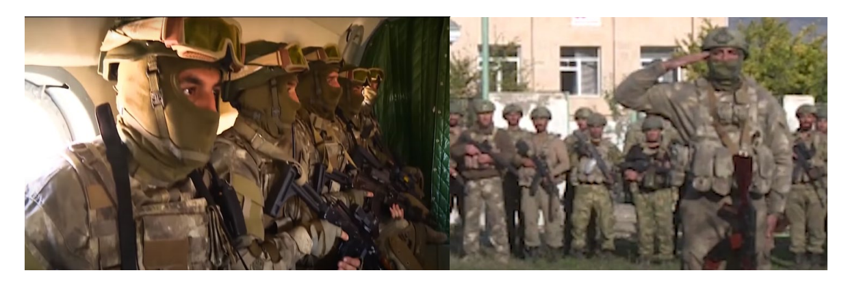
Left photo: a serviceman of the Rapid Response Unit of the SBS during a demonstrative drill. Right photo:a serviceman of SBS of Azerbaijan in front of the Kovsakan Middle School.

71. The servicemen of SBS appear in the media wearing several types of military uniforms with various patterns. In the video published on 20 October 2020, the SBS soldiers appear wearing green, tan and khaki uniforms of various patterns. Most of those are identical to the uniforms worn by the Rapid Response Unit of the SBS<sup>27</sup> (Çevik Hərəkət Dəstəsi).