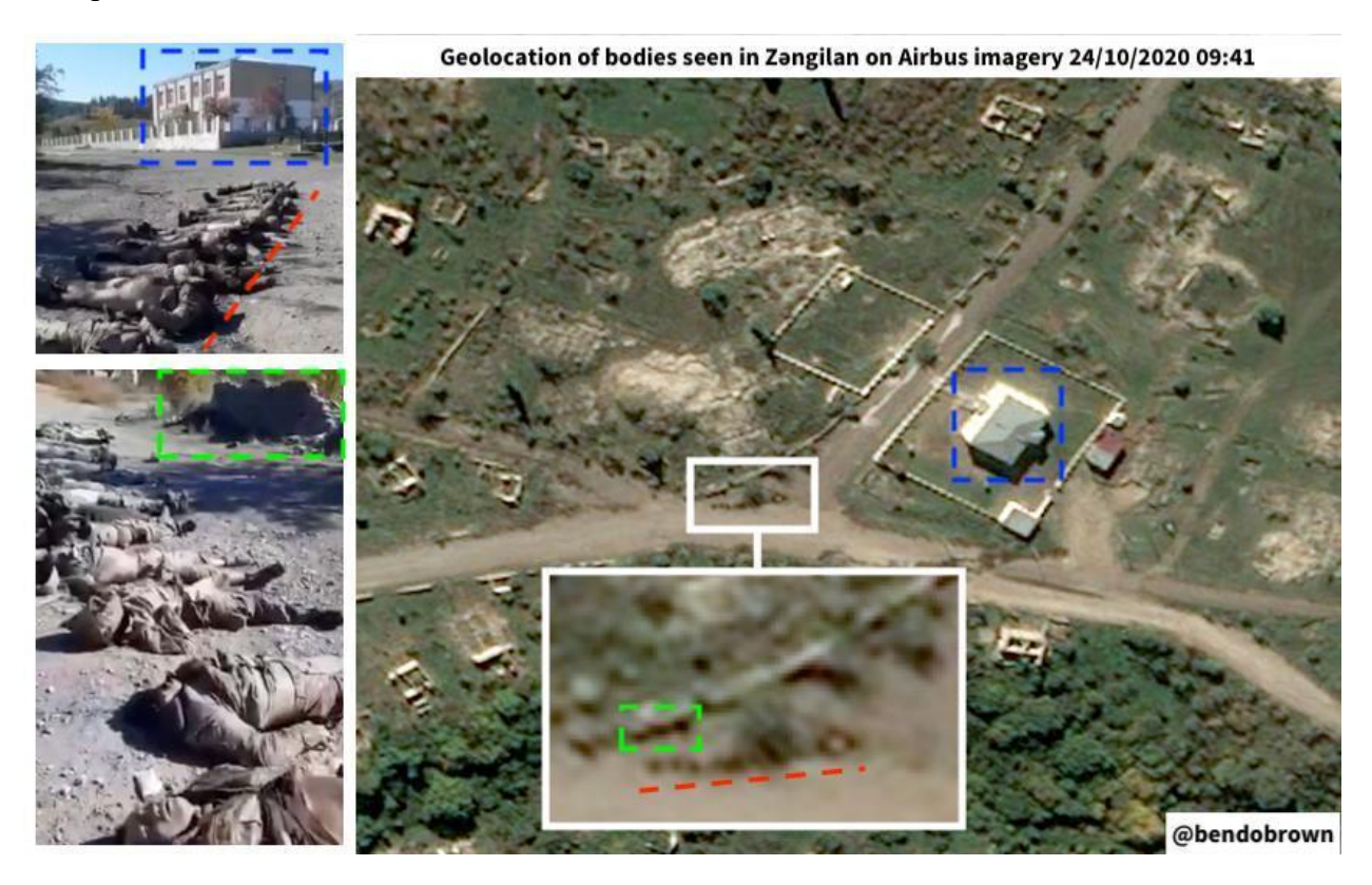
The photo collage created by Benjamin Strick and posted on his Twitter account.

shared the <u>geolocation</u> of Videos 7, 8 and 9 on his Twitter account.<sup>26</sup> The image was captured at 09:41 on October 24.