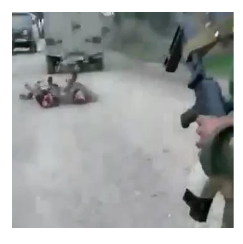
Left photo: servicemen of the Rapid Response Unit of the SBS carrying Azerbaijani-made Khazri rifles. Right photo: a Khazri rifle appears in the video depicting corpses of Armenian soldiers being dragged. Note the two-sector part of the gunstock.

74. The most distinct camouflage pattern used only by SBS is a variation of a woodland camouflage with black, dark green and aqua green shapes on a sea green background. The pattern is used in production of field uniforms, vests, helmet covers and other equipment.