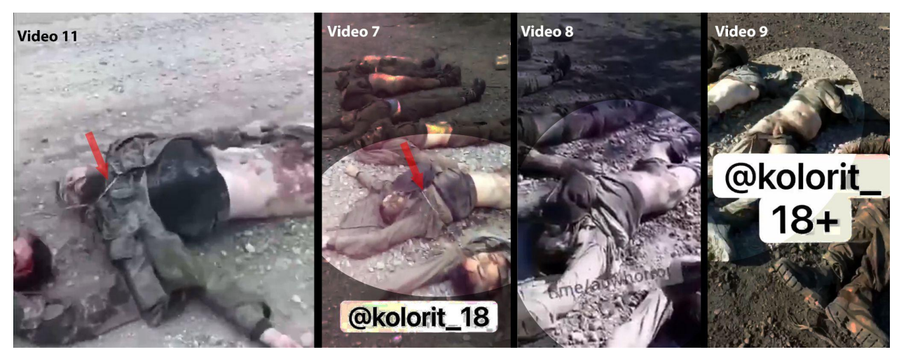
A body of an Armenian serviceman seen in Videos 11, 7, 8 and 9. Note the rope attached to the body.

69. Another <u>video</u> was spread on the Internet, depicting several dead bodies of Armenian servicemen lying on the ground. Two of the corpses are being dragged along the ground, tied with a rope. These 2 corpses can also be seen in Videos \frac{7}{2} , \frac{8}{2} and \frac{9}{2} .