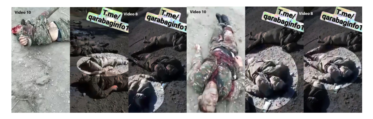
Photo collages demonstrate the same two bodies from Video 10 appearing in Video 8.

The two men from Video 10 also appear in the next videos, as 2nd and 3rd from the right.