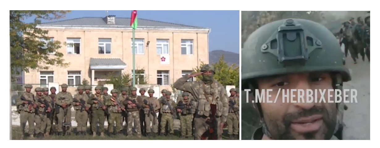
Left photo: servicemen of the SBS of Azerbaijan in front of school after Tatul Krpeyan.

72. The Azeri soldiers standing in front of the school building are wearing combat helmets with tactical attachment mounts. An Azeri soldier appearing in Video 4 wears a helmet of the same type.