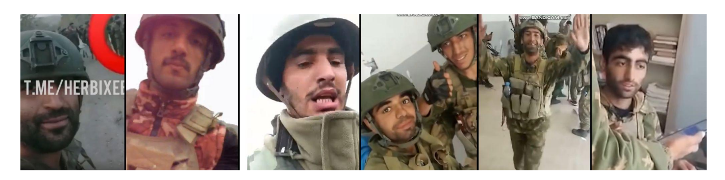
Faces of servicemen of the SBS seen throughout the videos depicting the Kovsakan Incident.

others depicting the Kovsakan Incident, faces of SBS servicemen are clearly seen and may be further identified during a proper investigation.