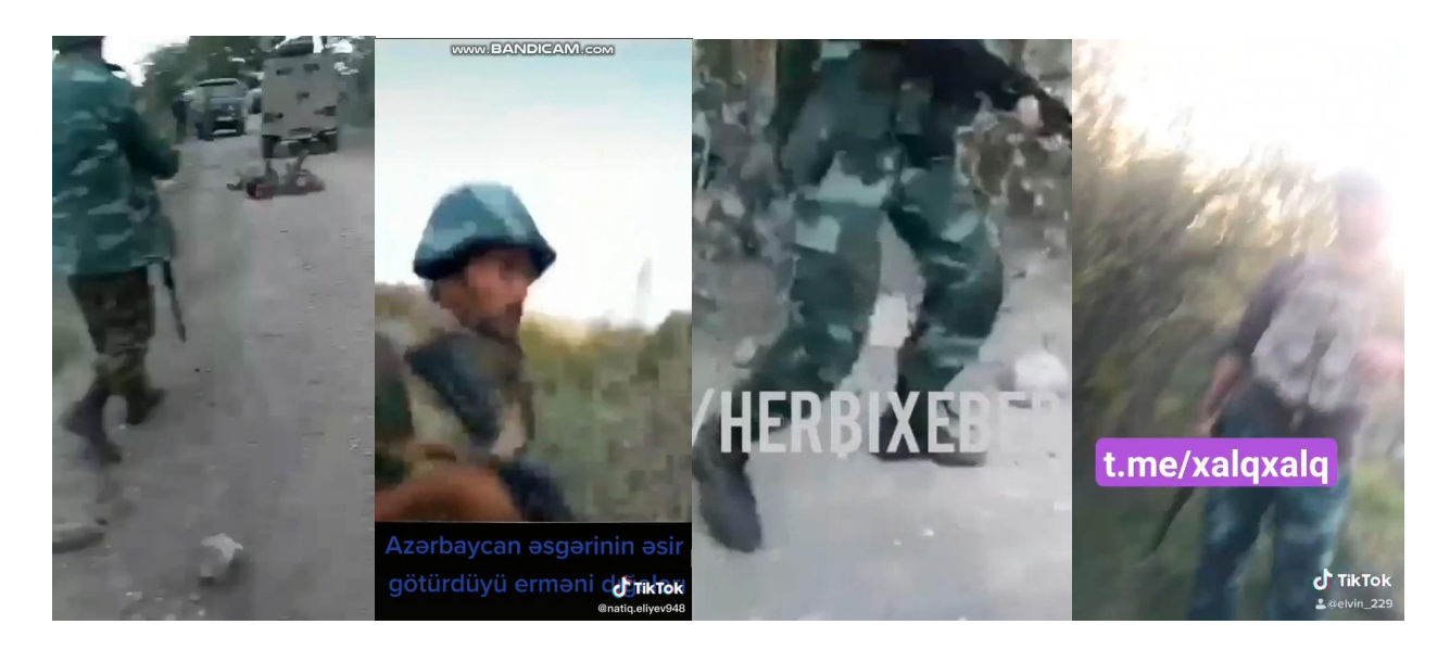
From left to right: servicemen of the SBS appearing in Videos 11, 2, 3 and 5 respectively.

75. Soldiers <u>appearing in the videos</u> of the Kovsakan incident are wearing uniforms of this pattern. It should be noted, that at the end of Video 5, depicting 13 captives kneeling in a row, another soldier with the SBS uniform appears at the same spot, from which the video of execution was taken.